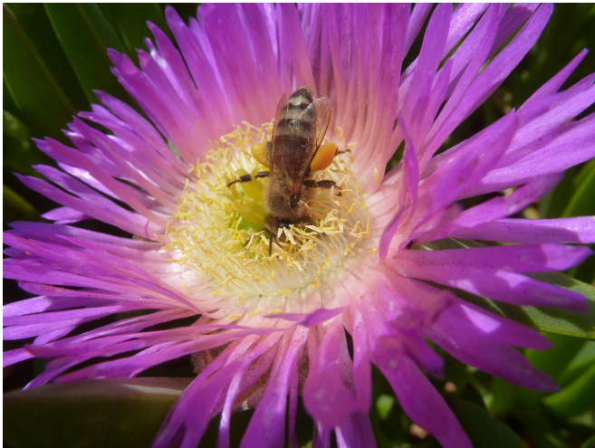
A honey bee pollinates a Carpobrotus plant.

An unprecedented study integrating data from around the globe has shown that honey bees are the world's most important single species of pollinator in natural ecosystems and a key contributor to natural ecosystem functions. The first quantitative analysis of its kind, led by biologists at the University of California San Diego, is published Jan. 10 in Proceedings of the Royal Society B .